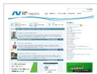
Microsoft .Net Magazine