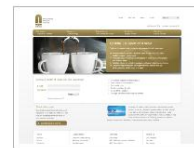
NIPO Software - Customer support center