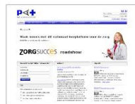
PAT Learning Solutions