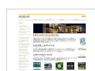
Kubus architectural solutions