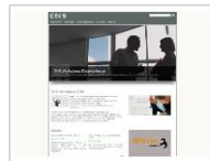
CNS Woningbouw Datawarehouse